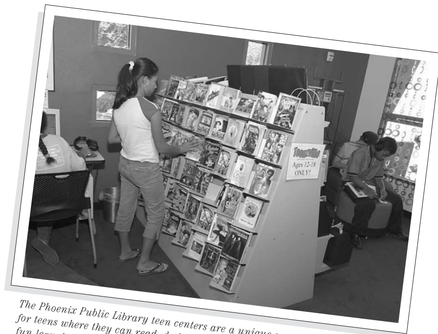
The Phoenix Public Library teen centers are a unique space, designed by teens, for teens where they can read, do homework or catch up with each other in a fun learning environment.